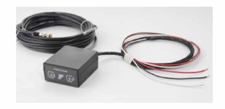
Figure 3: LST display box