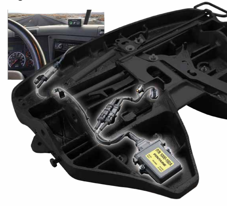
Figure 2: LST Fifth Wheel

Coupling display box with the 31 foot wire (display to fifth wheel connection), a 5.5" long M12 to 4 Pin Deutsch DT coupler cable is also included.