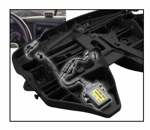
Figure 1: LST Light Sequences

ISO/TS16949 REGISTERED TB-062 • June 2017