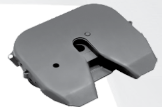
SLTPLCD700-D5 (Driver side release)