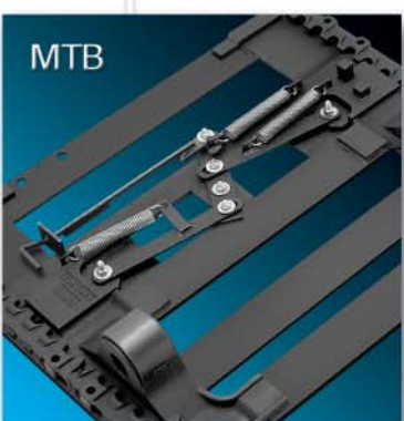
For customers preferring a manual slide rather than an air slide, Fontaine® offers the MTB model in the same sizes as the ATB.