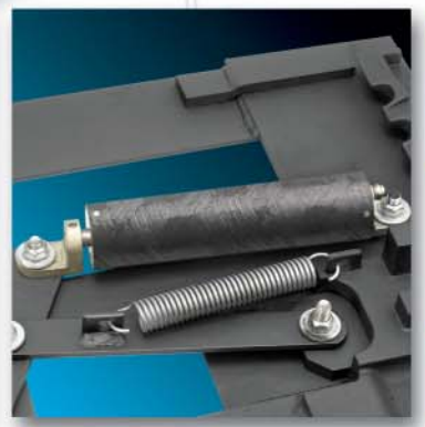
Composite air cylinder features improved sealing performance and superior corrosion resistance for longer service life.