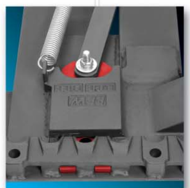
New Quad-Lock™ four point locking system increases locking surface area for greater stability and improved wear characteristics.