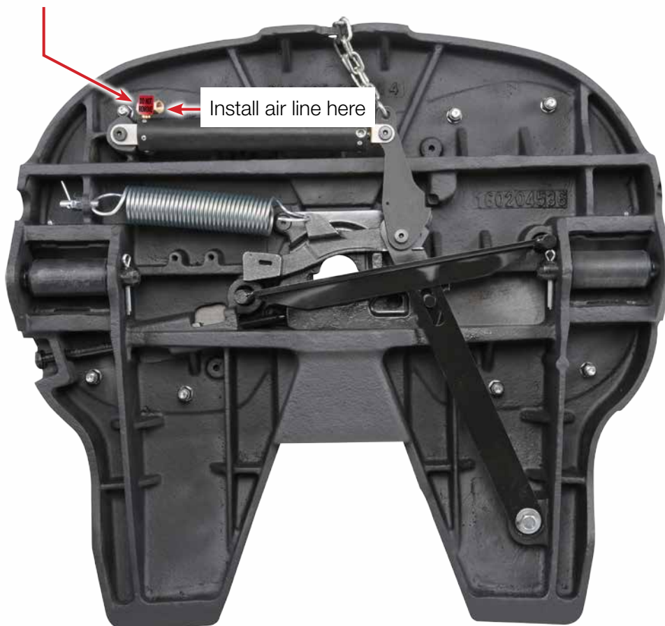
Figure 1: Underside view of the Fontaine Armor

DO NOT REMOVE THE 3-WAY VALVE. Removing the 3-way air valve voids the warranty.