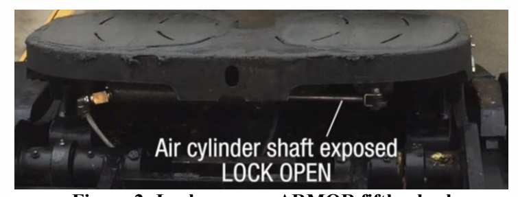
Figure 2: Lock open on ARMOR fifth wheel

When the fifth wheel opens, it exposes the air cylinder shaft and indicates to the operator that the wheel is in the unlocked position (Figure 2).