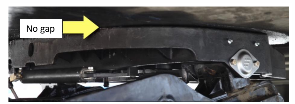
Figure 4: Fifth wheel plate is flat against trailer plate

This feature requires that the top surface of the fifth wheel be flat against the trailer plate to position the kingpin properly within the throat of the wheel (Figure 4). As with any fifth wheel, the proper way to couple involves raising the trailer with the fifth wheel and ensuring the trailer plate is flat against the top of the fifth wheel plate. More information on proper coupling instructions for the driver can be found here: <a href="http://www.fifthwheel.com/armor/video">http://www.fifthwheel.com/armor/video</a> armor operating instructions.html