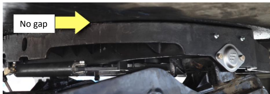
Figure 4: Fifth wheel plate is flat against trailer plate

This feature requires that the top surface of the fifth wheel be flat against the trailer plate to position the kingpin properly within the throat of the wheel (Figure 4). As with any fifth wheel, the proper way to couple involves raising the trailer with the fifth wheel and ensuring the trailer plate is flat against the top of the fifth wheel plate. More information on proper coupling instructions for the driver can be found here: http://www.fifthwheel.com/armor/video_armor_operating_instructions.html