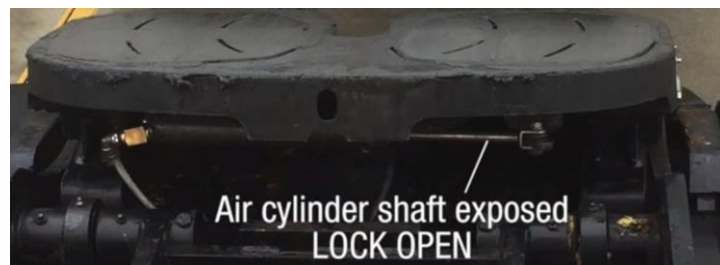
Figure 2: Lock open on ARMOR fifth wheel

When the fifth wheel opens, it exposes the air cylinder shaft and indicates to the operator that the wheel is in the unlocked position (Figure 2).