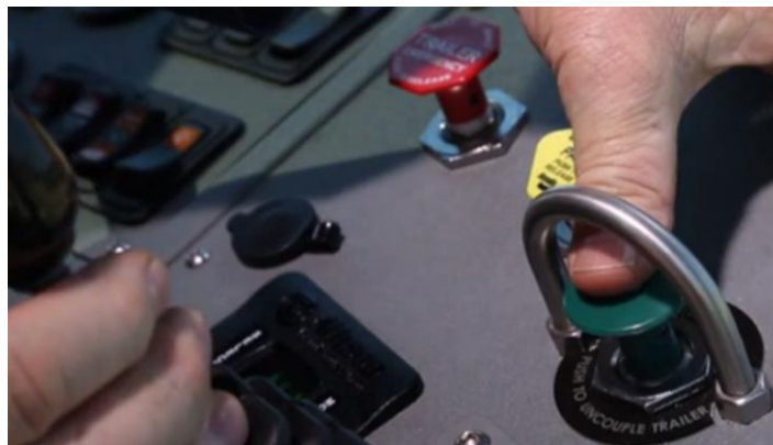
Figure 1: Fifth wheel unlatch button activation

When the unlatch button is pressed (Figure 1), the fifth wheel opens, moving the lock jaw across the throat and “setting up” for the next couple (Figure 3). If you continue to hold the button down during the coupling process, the fifth wheel will not latch properly.