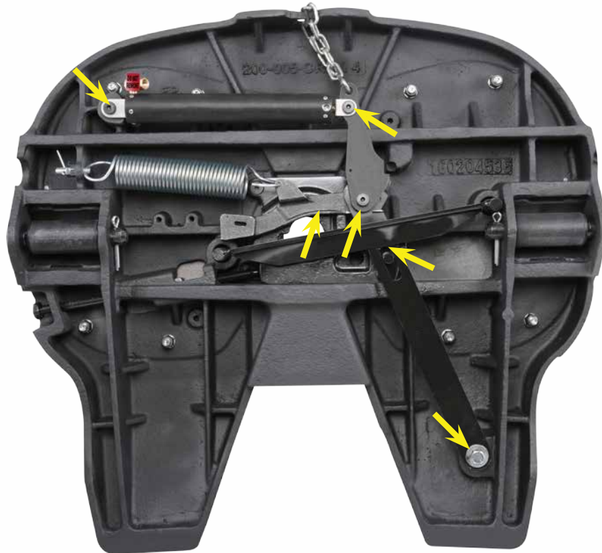
Figure 2: Underside view, Lubrication points of Fontaine Armor

From the underside of the wheel, grease should be applied to the areas indicated in Figure 2.